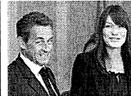
New Baby for French President?