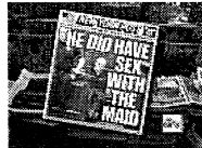
Victim's lawyer on IMF chief case