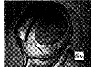
Giffords set for skull reconstruction